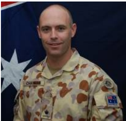
Logistics Support Company (LSC)