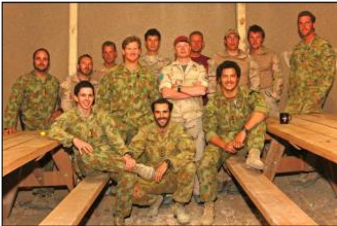
The 'original' Mentoring Team Charlie HQ team farewelling their Dutch AASLT BG counterparts in May 2010

With the end of the deployment in sight, no-one has lost focus of the busy time between now and then which will no doubt keep the CP abuzz.