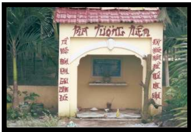
SHRINE AT “CORAL-BALMORAL”

On the way back to Saigon the next day we visited the area of Fire Support Bases Coral and Balmoral. The entire area has now been planted to rubber but two Vietnamese Monuments stand over mass graves where Australians buried more than 200 enemy during that operation.